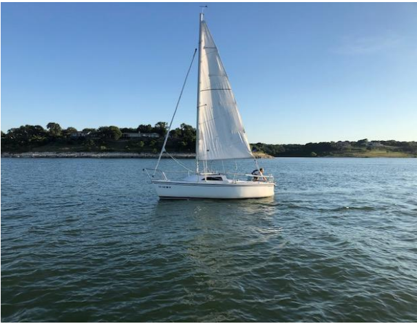
Vice Commodore single handing his Capri 18.

Finally, we have ID cards available for members. LBYC is a member of Yacht Clubs of America. In order to gain access to other Yacht Clubs you will need your current ID card. It is best to check with the club prior to traveling. Some clubs require a letter of introduction from LBYC, and we can get this for you.